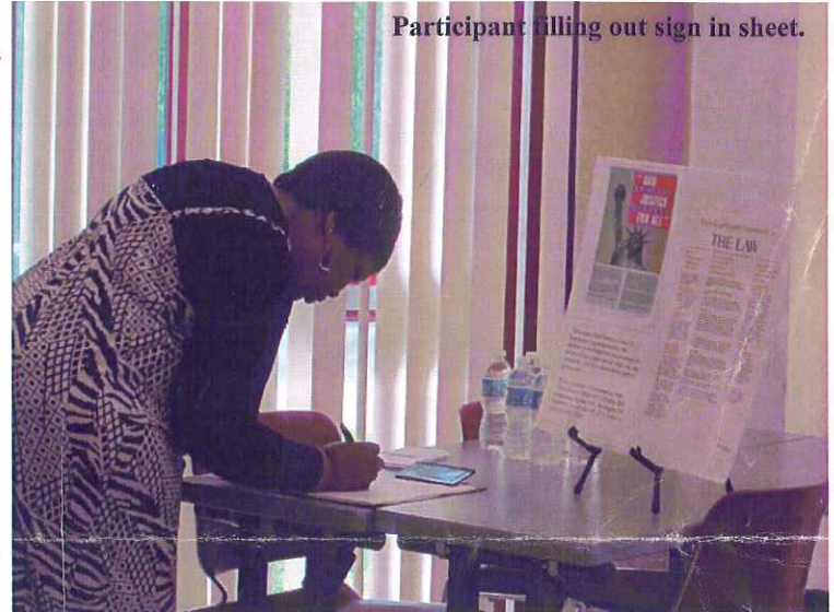
Participant filling out sign in sheet.