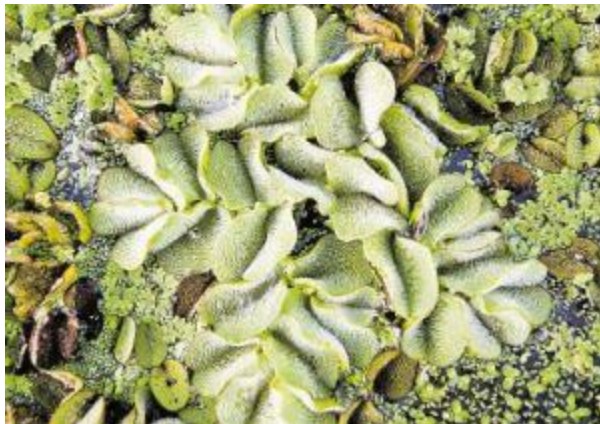
Michael Cavazos. Weevil infested salvinia is loaded into containers in July 2012 to be transported to the Caddo Lake National Wildlife Refuge's salvinia weevil rearing facility in Karnack.

Longview News-Journal | Posted: Tuesday, February 5, 2013, 4:00 am