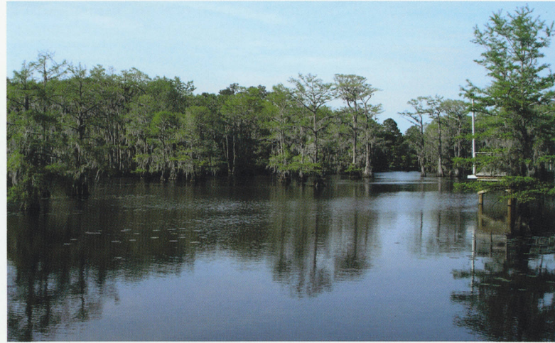
Caddo Lake's signature bald cypress trees need the high and low flow of waters for distribution and germination of their seeds.

These flow recommendations, when implemented by the Corps, will enhance the ecological structure and function of Big Cypress Creek, its floodplain and