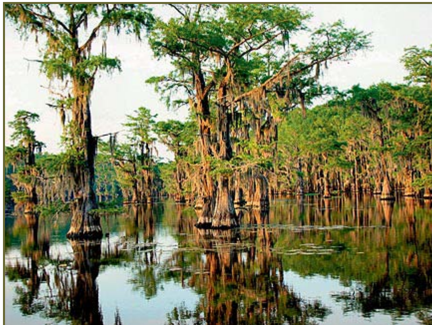
SPANISH MOSS drips in ghostly tatters from cypress trees at Caddo Lake (above), a complex of bayous, ponds, bogs and other wetlands sprawling across 30,000 acres in east Texas.

Jefferson now specializes in nostalgia, and a small paddle wheeler, the Graceful Ghost, plies Caddo alongside the occasional pontoon boat or rental canoe. Maps and markers for "boat roads" help boaters find their way through mazelike waterways, for without care a visitor can spend a chilly night lost among screech owls and knobby, centuries-old bald cypresses.